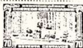
ARROYO DEL RIO